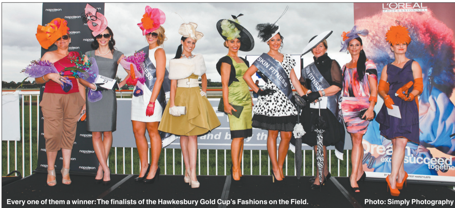
Every one of them a winner: The finalists of the Hawkesbury Gold Cup's Fashions on the Field.